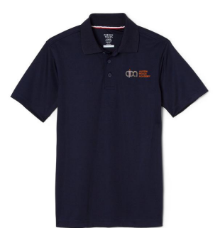
Short Sleeve Polo

Pants-- Khaki Tops-- Navy Blue with LOGO